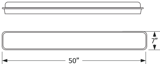
Figure 1 • Dimensions